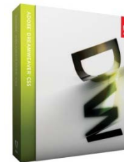
Adobe Dreamweaver CS5