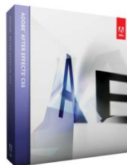
Adobe After Effects CS5