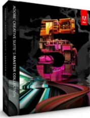
Adobe Creative Suite 5 Master Collection