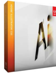
Adobe Illustrator CS5