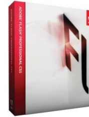
Adobe Flash Professional CS5