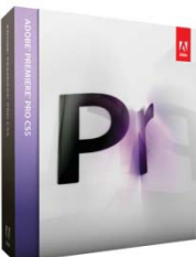
Adobe Premiere Pro CS5