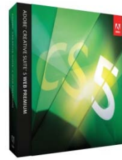
Adobe Creative Suite 5 Web Premium