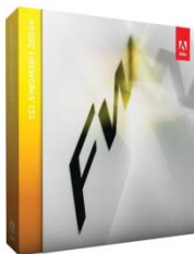
Adobe Fireworks CS5