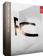
Adobe Flash Catalyst CS5