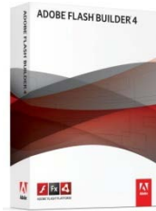
Adobe Flash Builder 4