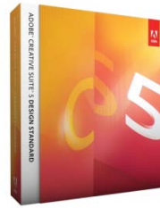
Adobe Creative Suite 5 Design Standard