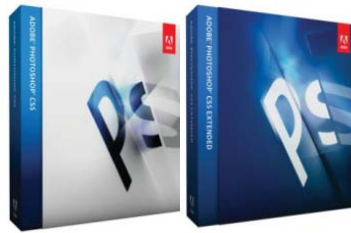
Adobe Photoshop CS5